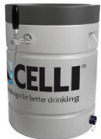
Portable Beer Dispenser

Please ask how we can help your organisation implement these new sustainable, efficient, and low-consumption dispensing systems.